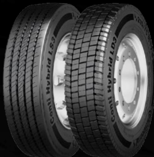
Conti Hybrid LS3 (1) Conti Hybrid LD3 (2)