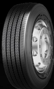
Conti Urban HA3 M+S (1)