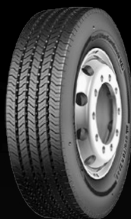
Conti UrbanScandinavia HA3 (1)