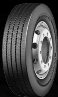
Conti Urban HA3 (1)