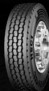
HSC1 (1) to be used on all axles