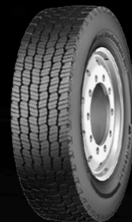
Conti UrbanScandinavia HD3 (2)