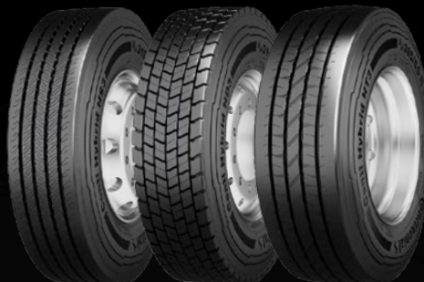
Conti Hybrid HS3 (1) available in 19.5" and 22.5" Conti Hybrid HD3 (2) available in 19.5" and 22.5" Conti Hybrid HT3 (3) available in 19.5" and 22.5"