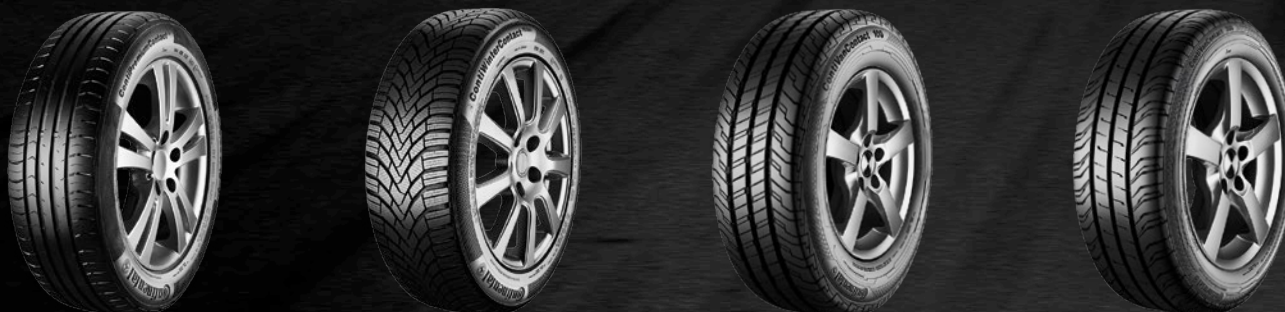
ContiPremium Contact 5