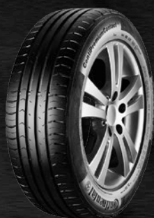
ContiPremium Contact 5